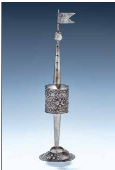
108. A SILVER SPICE CONTAINER. Germany, c. 1900. On a crimped base with a solid floral midsection and a flag. 8.2" tall. Estimate $300 - 500