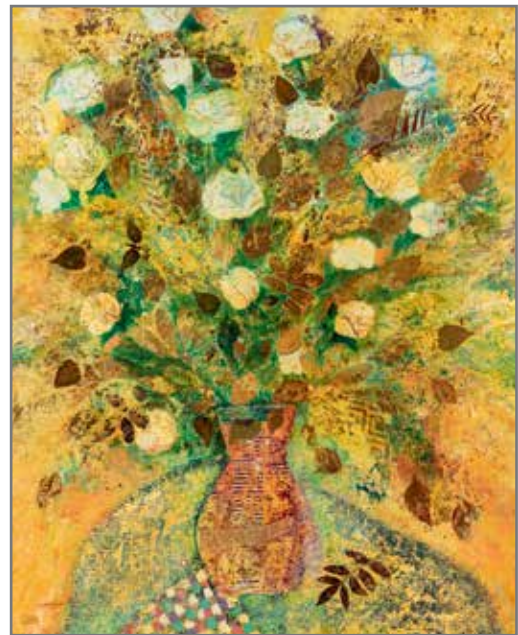
189. ANATOLY BARATYNSKY. Still life. Oil on canvas. 36.25" x 27.25". Estimate $1,200 - 1,500