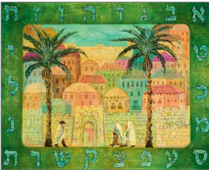
188. ANATOLY BARATYNSKY. Jerusalem. Oil and mixed media on canvas. 31.5" x 39". Estimate $1,200 - 1,500