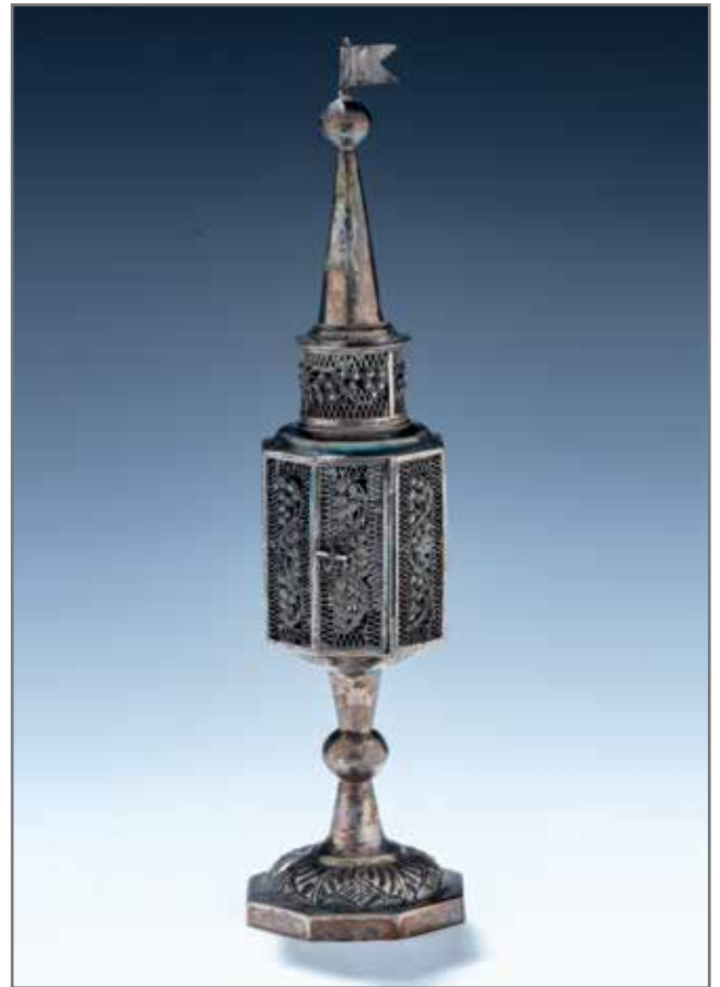
122. A SILVER FILIGREE SPICE CONTAINER. Poland, c. 1880. On an octagonal base with knobbed stem and eight sided filigree body. 9.4" tall. Sold J. Greenstein and Company, Inc., April 23, 2007. Estimate $900 - 1,200