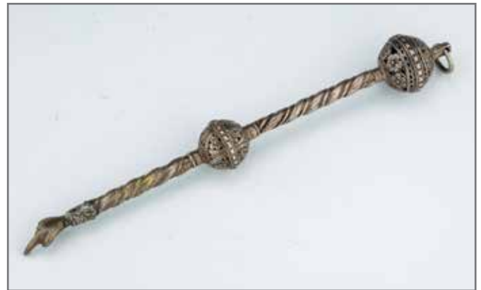
124. AN EARLY SILVER TORAH POINTER. Poland, 1804. Composed of two carved silver spheres that connect to a twisted body. Engraved with dedication dated to 1804. 8" long. Sold. J Greenstein and Company, inc June 12, 2006, lot 178. Estimate $1,200 - 1,500