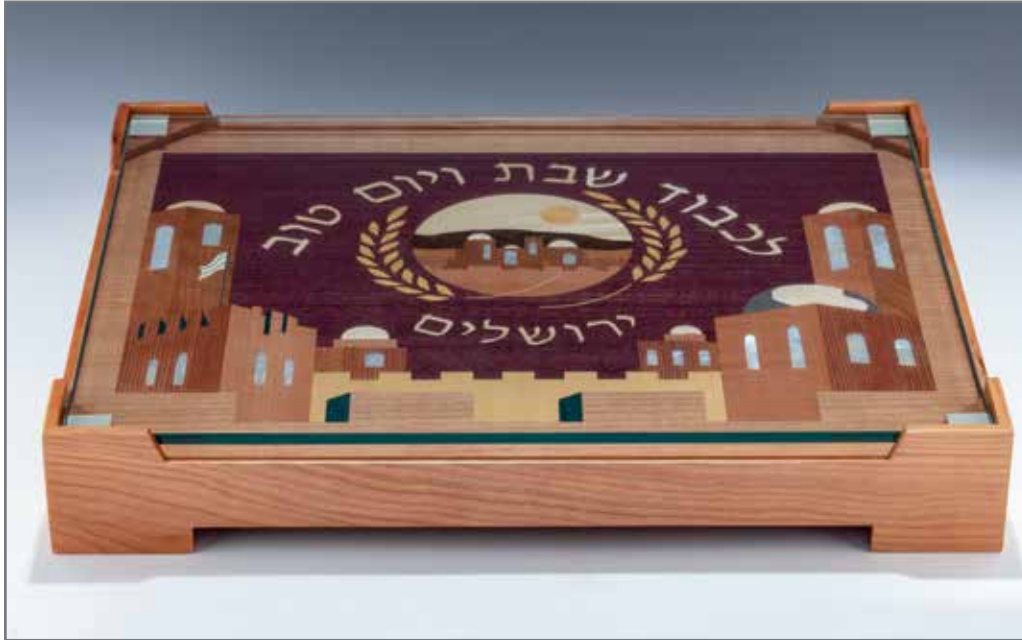
166. A HAND MADE CHALLAH BOARD BY ALEX AND LORELEI GRUSS. Brooklyn, NY 2021. Hand crafted with multiple colors of wood, a cherry wood frame and tempered glass. Central scene of the Old City of Jerusalem and IN HONOR OF THE SABBATH AND YOM TOV. 16" x 13". Estimate $2,400 - 3,000