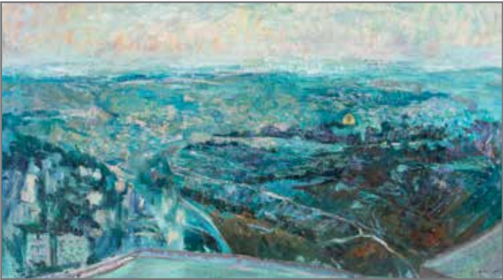
185. JULIE COTTLER. The Hills of Jerusalem. Oil on canvas. 23.25" x 29.25". Estimate $1,400 - 1,600