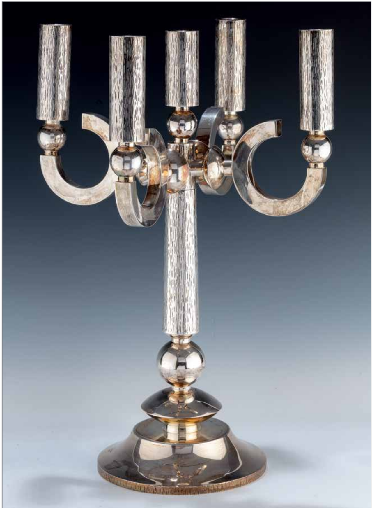
157. A LARGE STERLING SILVER SABBATH CANDELABRA BY CARMEL SHABI. Jerusalem, c. 1995. On round base with three level body and five lights. Signed and marked. 18.9" tall. Estimate $6,000 - 9,000