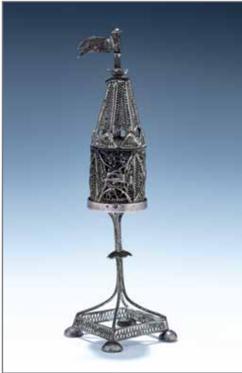
104. A SILVER SPICE CONTAINER. Vienna, c. 1880. On four cupped feet and four connected wire supports that attach to a tubular shaped filigree container topped by a flag. 8.3" tall. Estimate $400 - 800