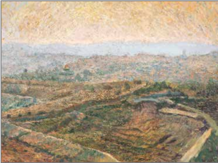
184. JULIE COTTLER. Jerusalem Landscape. Oil on canvas. 23.5" x 32.5". Estimate $1,400 - 1,600