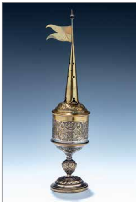
109. A SILVER PLATED BRASS SPICE CONTAINER. Poland, c. 1890. On a round base with an ornate midsection that comes off for the insertion of spices. 10.9" tall. Estimate $300 - 500