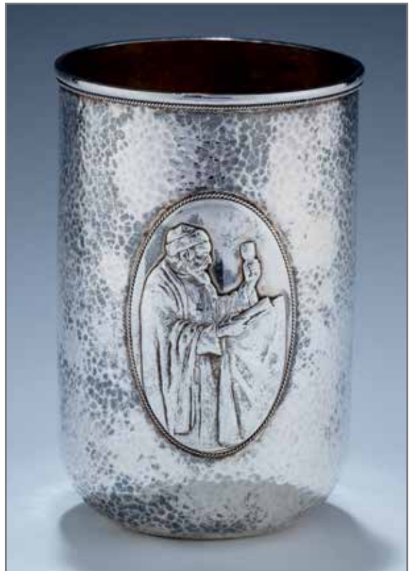
160. A LARGE STERLING SILVER KIDDUSH BEAKER BY YAAKOV YEMINI. Jerusalem, c. 1985. Hand hammered. With an applied plaque of an elderly rabbinical figure holding a glass of wine while apparently reciting the Kiddush. Gilded interior. Signed: Yaakov Yemini, Jerusalem. Sterling, 925. 4.3" tall. Estimate $2,000 - 3,000