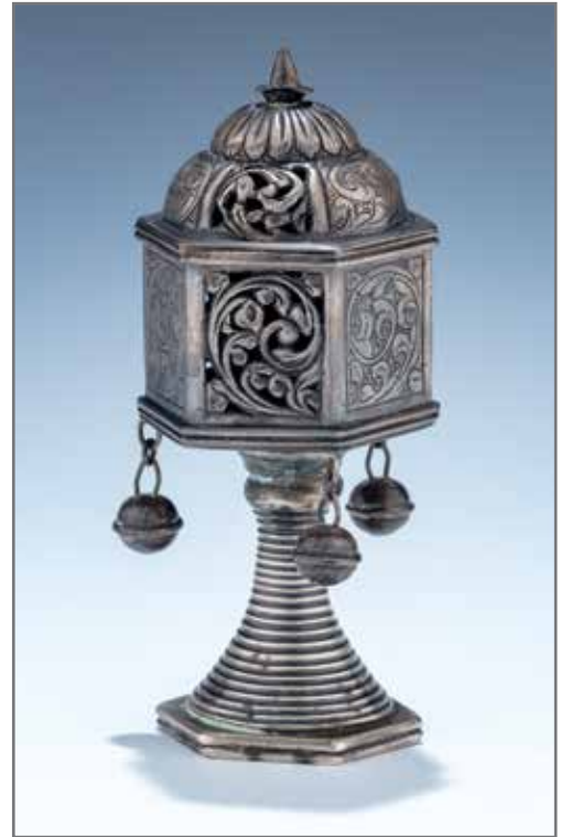
105. A SILVER SPICE CONTAINER. On a six sided base. Upper portion engraved with period design. The base and upper section, possibly merged. 5.5" tall. Estimate $300 - 500