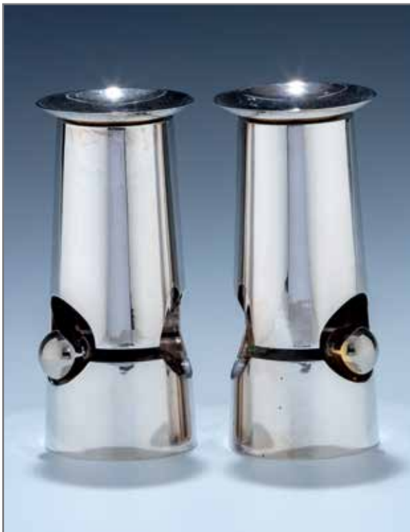
167. A PAIR OF STERLING SILVER CANDLESTICKS BY CARMEL SHABI. Jerusalem, c. 1995. In modern form. With a silver ball in midsection. Fitted with original bobèches. Marked, signed and dated. 4.8" tall. Estimate $1,200 - 1,500