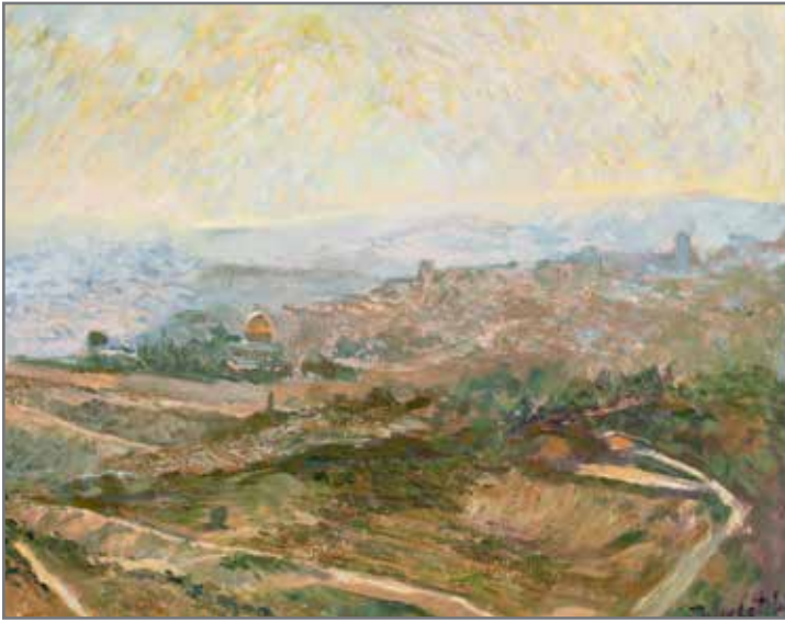
182. JULIE COTTLER. Jerusalem landscape. Oil on canvas. 36" x 25.5". Estimate $1,400 - 1,600