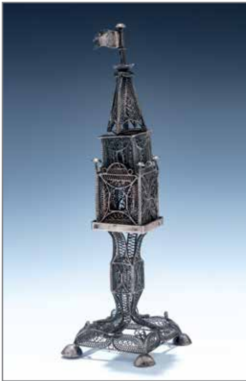
106. A SILVER SPICE CONTAINER. Vienna, c. 1880. On four cupped feet. Composed completely of finely spun filigree wire work. Lacking a door. 9.3" tall. Estimate $500 - 800