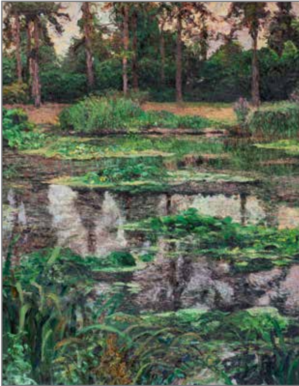
186. JULIE COTTLER. Galilee Landscape. Oil on canvas. 35.5" x 27.5". Estimate $1,400 - 1,600