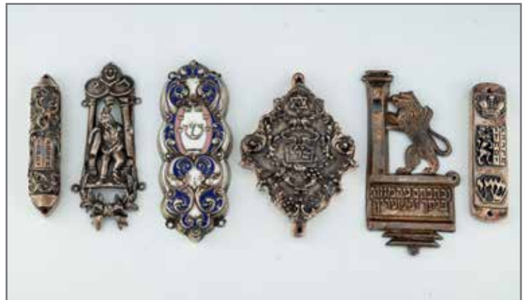
50. SIX STERLING SILVER MEZUZAH CASES. New York, c. 1990. Three by Henryk Winograd and two in decorative form. Various sizes. Estimate $1,200 - 1,500