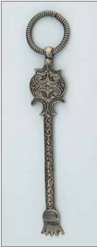
47. A SILVER TORAH POINTER. Probably Morocco, 19th century. With the original suspension ring. The body is engraved with a scrolling design. Final portion in the shape of a Hamsa. 6" long. Estimate $300 - 500