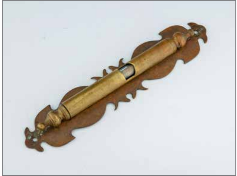
48. A BRASS MEZUZAH CASE. India, c. 1900. On a stylized backplate . The main section is tubular with clear plastic covering that is protecting the window. 8" long. Estimate $300 - 600