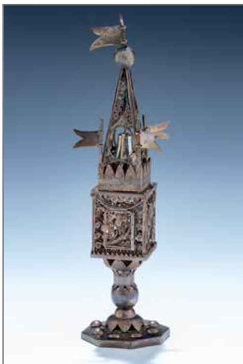
110. A SILVER SPICE CONTAINER. Bohemia, c. 1830. On an eight sided base that attaches to a decorated hand cut stem which connects to the main filigree section and steeple. Topped by a flag. Some flags now lacking. Similar examples can be found in the London Museum (numbers 431/432). 9" tall. Sold: J. Greenstein and Company, Inc., October 30, 2006; lot 137. Estimate $1,500 - 2,000