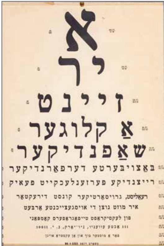
178. A YIDDISH EYE CHART. New York, c. 1920. The top few lines spell out "YOU ARE A SMART READER". On paper. 21" x 14". Estimate $900 - 1,200