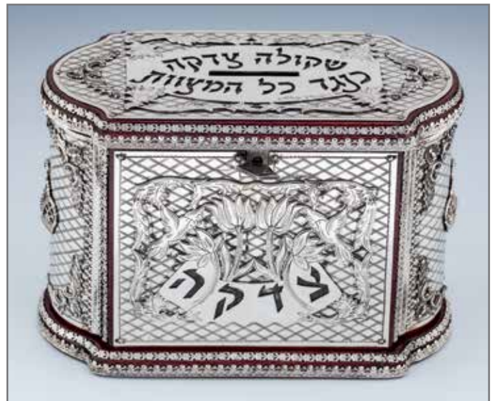
168. A SILVER AND WOOD CHARITY BOX BY GERSH WISHINSKI. Israel, c. 2004. Hand engraved with various charity related scriptural excerpts. 4.2" tall. Estimate $1,500 - 2,000