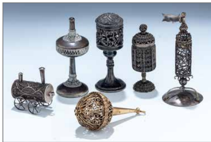
111. A GROUP OF SIX SILVER SPICE CONTAINERS. Continental and others, 19th and 20th centuries. Includes a Bezelel style filigree and solid silver spice container, a silver spice container completely comprised of filigree, a filigree pomander, a silver locomotive shaped spice container, a silver filigree spice container on three stemmed feet and tubular shaped body, a latticework spice container. Various sizes. Estimate $1,200 - 1,500