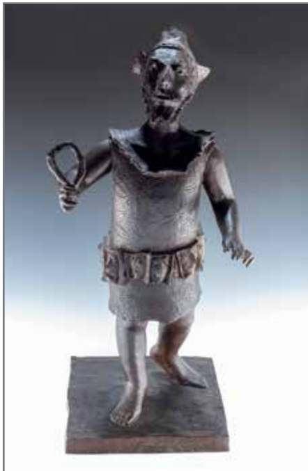
180. DAVID ARONSON. HIGH PRIEST. Bronze sculpture. 27" x 11". Signed. Estimate $1,200 - 1,500