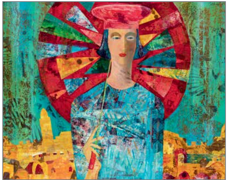
187. ANATOLY BARATYNSKY. Visiting Jerusalem. Oil and mixed media on canvas. 28.7" x 36". Estimate $1,200 - 1,500