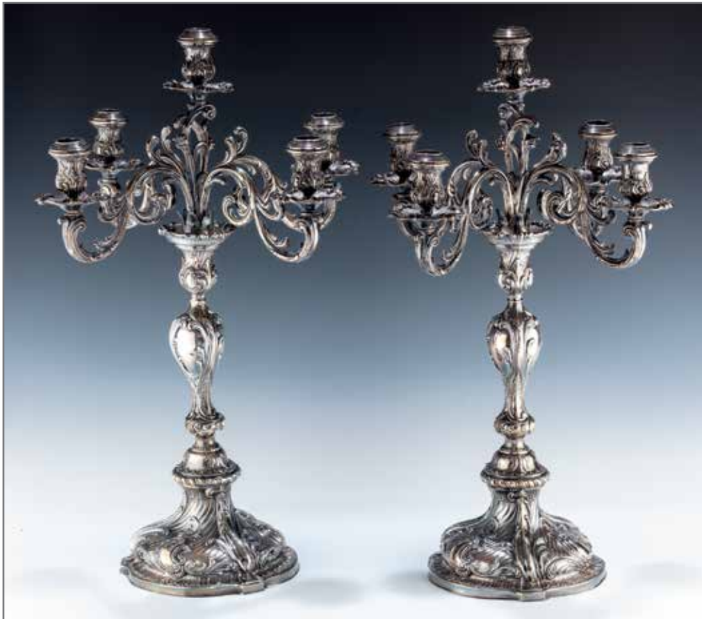
196. A PAIR OF LARGE SILVER CANDELABRAS. Vienna, c. 1890. Rococo in style. Each one capable of holding five candles. 20.2" tall each. Estimate $3,000 - 5,000