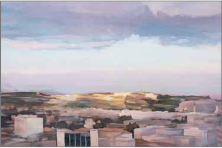
183. JULIE COTTLER. Sunset in Jerusalem. Oil on canvas. 24" x 24". Estimate $1,400 - 1,600