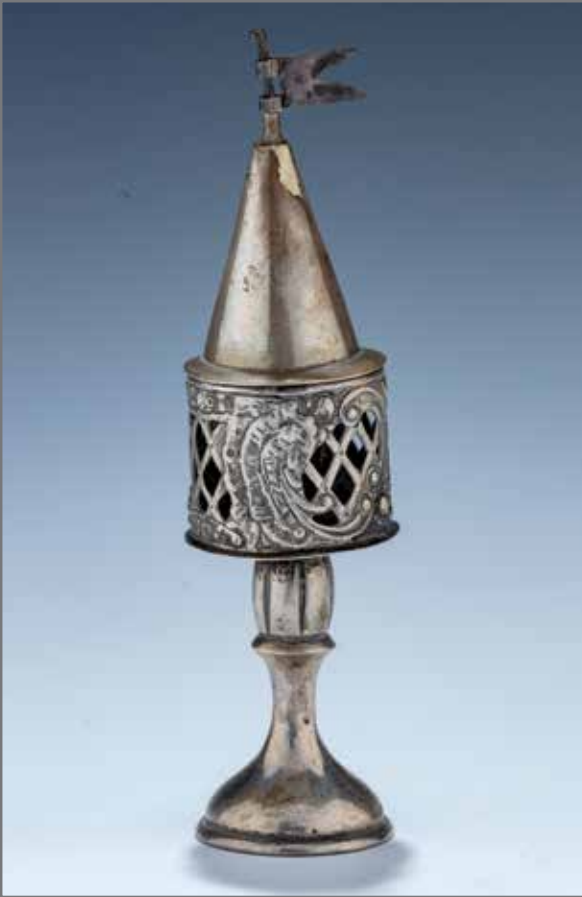
89. A SILVER SPICE CONTAINER. Germany, 20th century. On a round base with a latticework body. 6" tall. Estimate $300 - 500