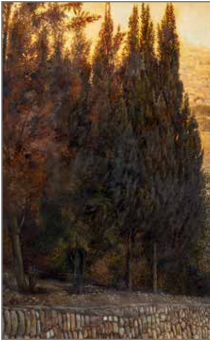
190. ELENA ADAM. Overlooking Jerusalem Old City walls. 31.5" x 19.7". Estimate $1,200 - 1,500