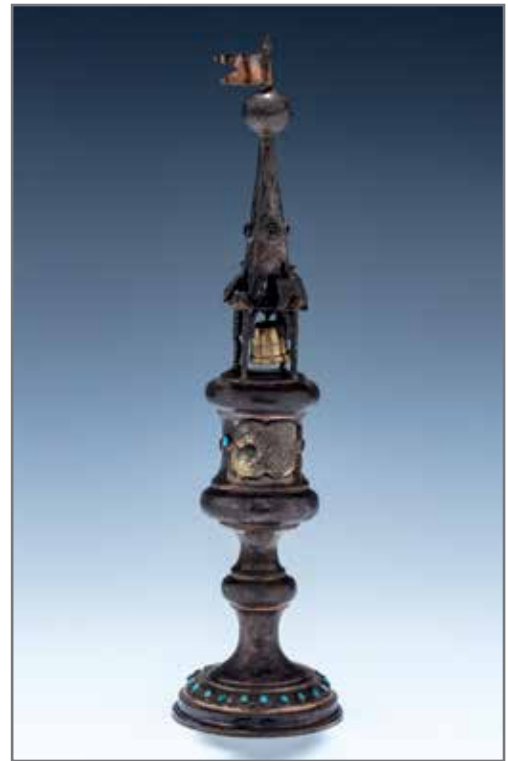
107. A SILVER SPICE CONTAINER. Poland, c. 1900. On a round base, decorated with applied blue stones. Upper section in spool form with applied eagles. 9" tall. Estimate $500 - 800