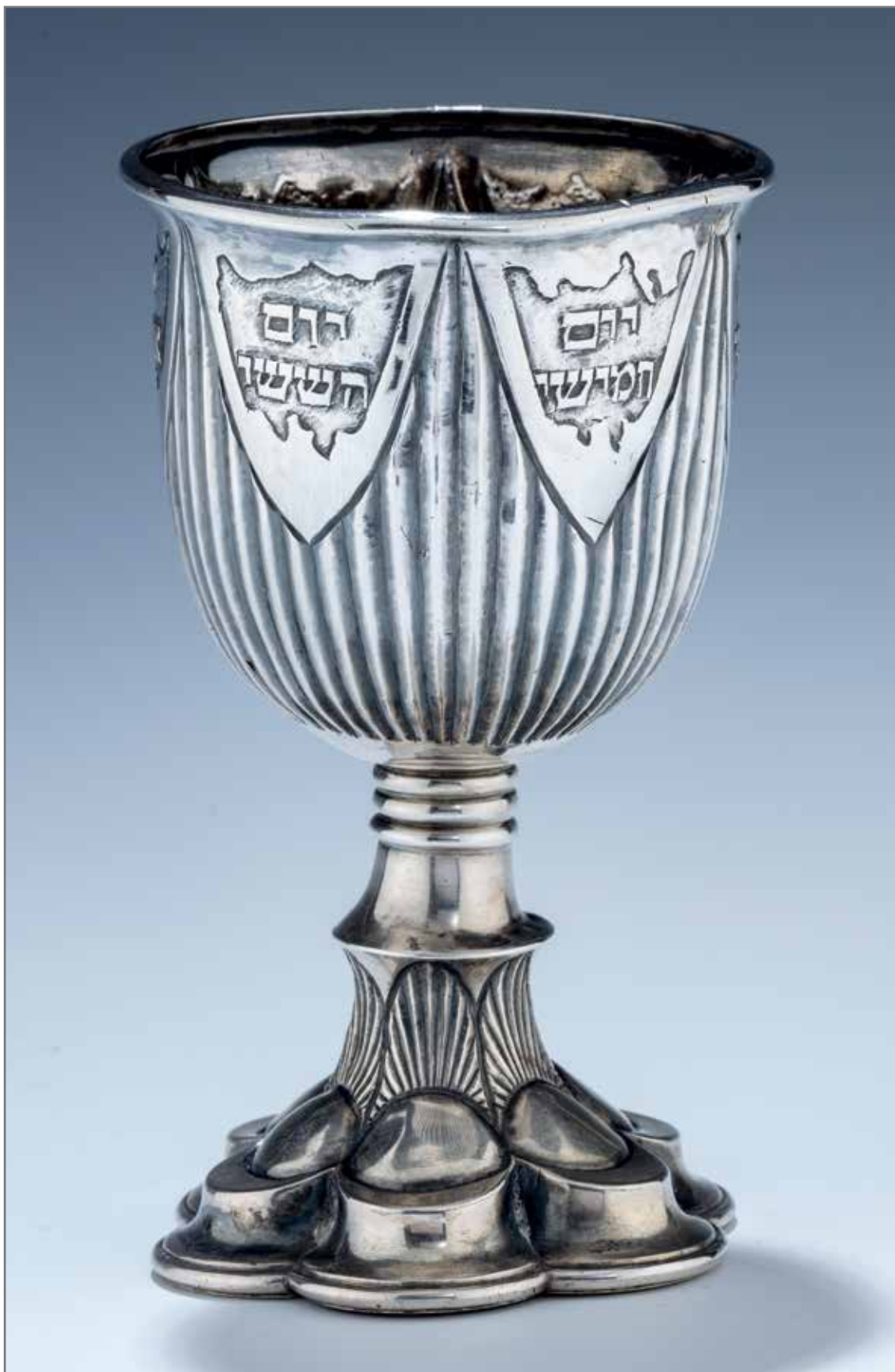
151. AN IMPORTANT SILVER KIDDUSH GOBLET BY BERNHARD FRIEDLAENDER. Dusseldorf, c. 1920. On a six sided stylized base. Upper portion is hand chased with the six days of the week in Hebrew. Signed B.Friedlaender and Dusseldorf. 5" tall. Estimate $9,000 - 12,000