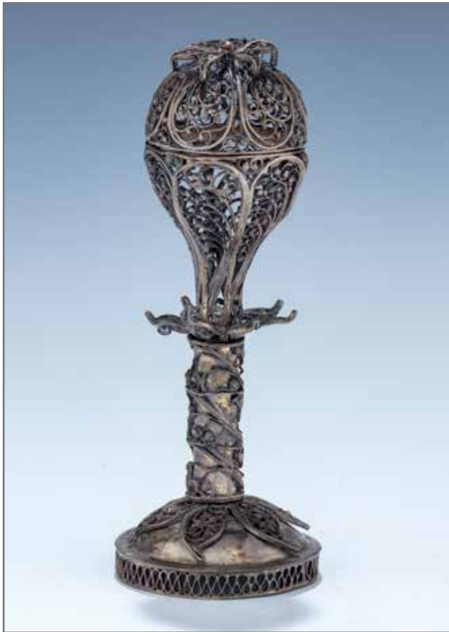
121. A SILVER FILIGREE SPICE CONTAINER. Ukraine, c. 1830. On a round base with filigree ornamentation that connects to the pomander spice section. 4.6" tall. Sold J. Greenstein and Company, Inc., October 15, 2007, lot 130. Estimate $600 - 900