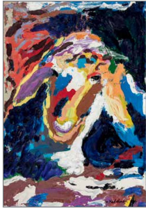
191. MENASHE KADISHMAN. (British/Israeli, 1932-2015), Abstract sheep's head, 1984, oil on paper laid down on canvas. Signed on lower right. Signed, dated and inscribed verso, canvas, 39" x 27". Estimate $1,200 - 1,500