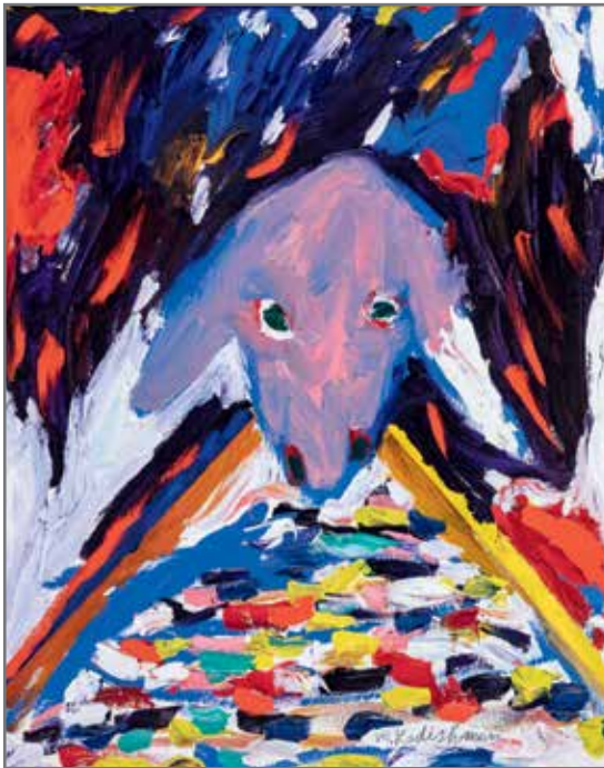
192. MENASHE KADISHMAN. (British/Israeli, 1932-2015), Abstract sheep's head, 1990, oil on canvas, signed lower right, signed, dated and inscribed verso, canvas: 36" h x 28.75" w. Overall (with frame): 36.75" x 29.5". Estimate $1,200 - 1,500